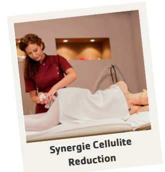
Synergie Cellulite Reduction